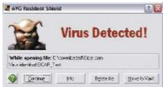
AVG Resident Shield does not allow you to start/open infected files and offers actions available to remove the virus

AVG Professional Single Edition provides antivirus protection for a single computer on multiple levels. It stops viruses before they can be saved to your PC and it detects viruses on your hard drive or removable media before they can be activated. It is AVG's combined use of advanced detection methods that ensures the reliability of AVG Anti-Virus when protecting your computer from viruses. When a virus is found, it is moved to the Virus Vault, where it is isolated and cannot cause damage.