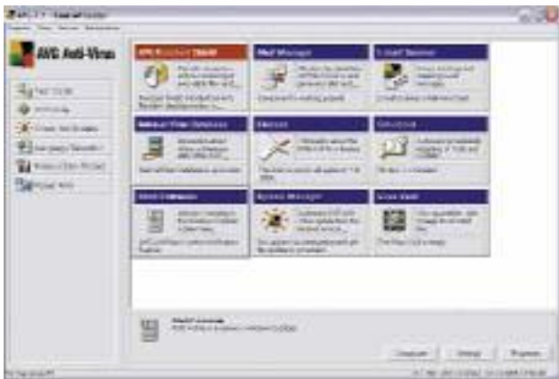
AVG Control Center – easy access to the main AVG components